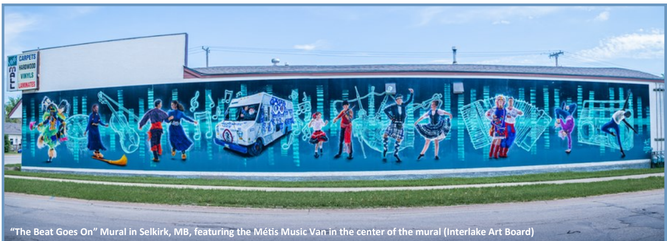
"The Beat Goes On" Mural in Selkirk, MB, featuring the Métis Music Van in the center of the mural

festivals, fairs, schools, and special celebrations throughout the province please contact cultureandheritage@mmf.mb.ca .