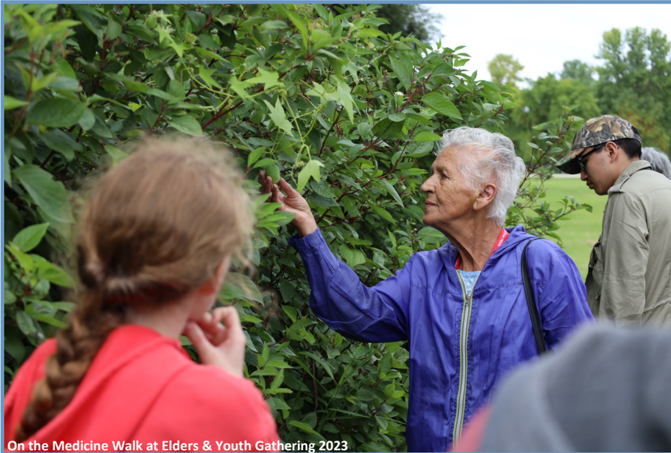
On the Medicine Walk at Elders & Youth Gathering 2023